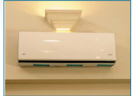
Above is a wall mounted ASU15RLS2 indoor model shown in a common area.

Marshall City Hall was built in 1996, under Mayor Dick Smitley and city council. The building would house the police department, utility office, city officials and council meeting room. The building has a central area with a raised ceiling, and is approximately 90' x 90' octagon. The mayor thought, the square dome look would create the flow of citizens into the city hall. Building was designed by Garmong Engineering.