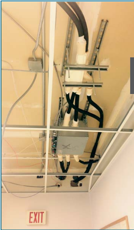
Above: A branch box is required as part of Fujitsu's Hybrid Flex Inverter (HFI) system AOU48RLXFZ1 which can connect from 2 to 8 indoor units.

“The building has never been this warm!”