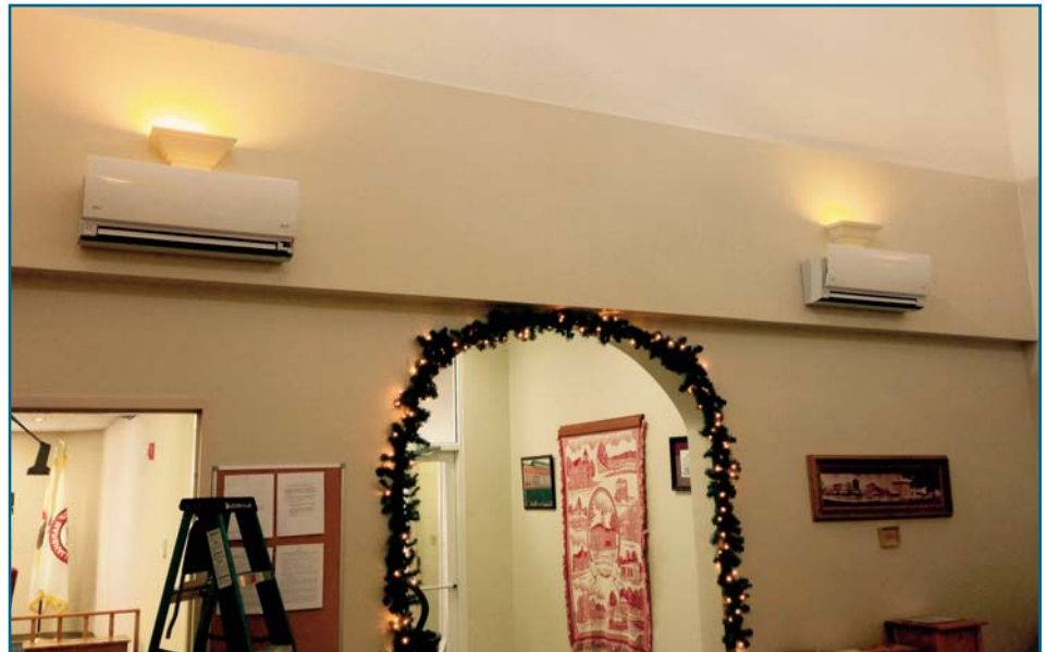
Below: Two 15,000 BTU/h RLS2-Series wall mounts were installed in the main area of the City Hall. These system are extremely energy efficient due to their high SEER ratings and ductless technology.

“The building has never been this warm!”