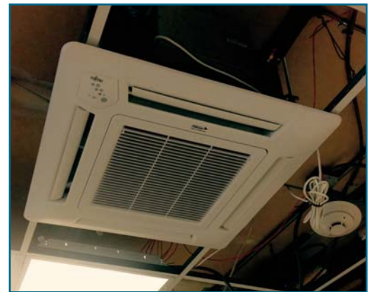
Shown is a compact cassette which is recessed into the ceiling, showing only the grille.

The police and council side of the building was discovered to have mold in the units and throughout parts of the ductwork. No return air duct was installed, therefore, allowing air to draw wild from the mechanical room. On the utility office side the condensing unit had a failed compressor and the same issue of no return air. Neither system would really maintain the comfort that city employees wanted.