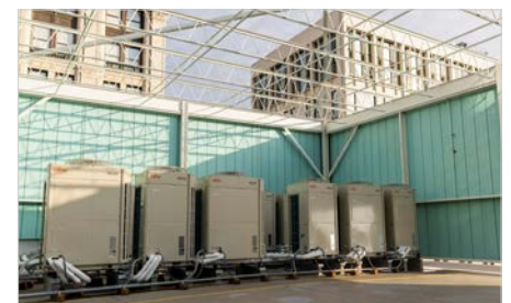
The 2nd through 12th floors of the Mutual Building are served by Airstage heat recovery systems installed on the roof.

In all, 200 tons of Fujitsu Airstage V-Series heat recovery equipment was installed, consisting of six, eight and 10-ton outdoor units. Inside, slim-duct air handlers were installed in living spaces, with ceiling cassettes in common areas. A total of 217 terminal units were installed.