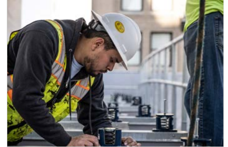
A Snyder Solutions crew prepares to mount heat recovery condensing units on seismic isolators.

To minimize the number of penetrations needed, combination sleeves were designed to house multiple penetrations in a line; only refrigerant lines, the plumbing system, and outdoor air risers run vertically through the building. All ductwork connected to the Fujitsu air handlers runs horizontally. Ventless dryers were used, so no drier stacks were needed.