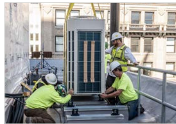
Airstage condensing units were mounted on seismic isolators.