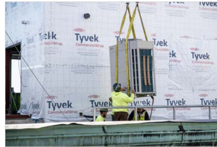
One of many Fujitsu Airstage heat recovery condensing units is craned to the 12th story roof.

"If it weren't for the need to conceal outdoor units, this project could have been conducted with mini-split heat pumps," said Snyder. "But Willis determined that VRF systems would better serve the purpose. The outdoor units needed