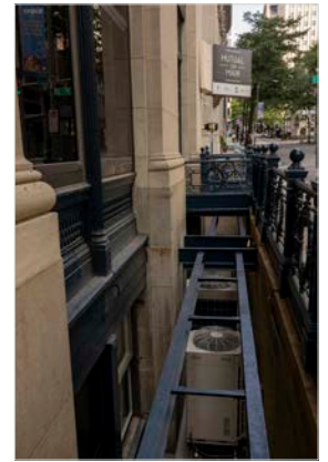
The ground floor, casement and sub-basement are served by heat recovery systems installed in light wells below street level.

This project exemplifies the delicate dance between preserving the past and embracing the future in architectural endeavors.