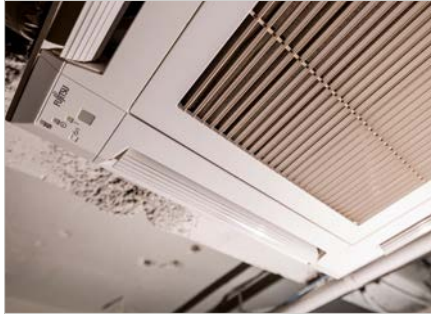
While most of the building is served by slim duct air handlers, a variety of ceiling cassettes were used on common areas storage space.

"The installation and commissioning went very smoothly," said Dukes. "That's a testament to a solid, adaptable design, fantastic communication between all parties, and an installation team that really committed to doing their best work."