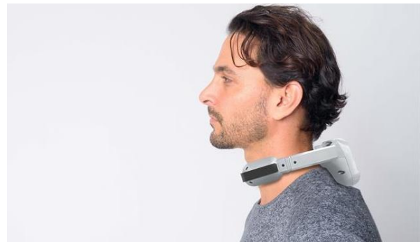
Integrated compact model

Fujitsu General's Wearable Air Conditioner is a neck cooling device that utilizes a Peltier element. Its cooling capacity makes it possible for the neck to feel cool by as much as 20°C below the ambient air temperature when worn. Leveraging Fujitsu General's core strength in air conditioning technology and expertise, we designed the device with professional specifications. A built-in heat exchanger dissipates generated heat from the Peltier element into water. This results in consistently excellent cooling performance, even in harsh environments of over 40°C. Since its launch in 2021, the product has been adopted by over 500 companies in Japan for use in fiercely hot workplaces, in steel, plant engineering, and other industries. In a wide variety of applications, it has demonstrated its value under severe conditions.*1