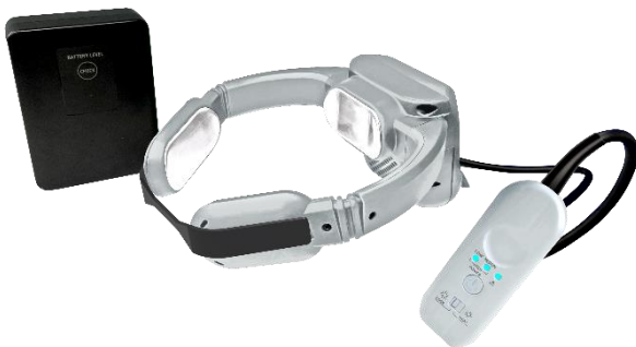
Wearable Air Conditioner