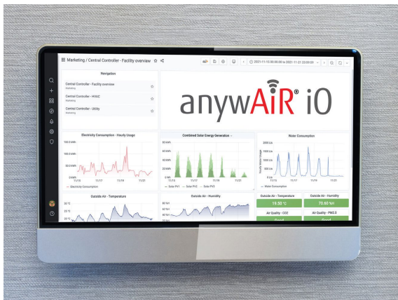
Operating conditions and data are displayed on the anywAIR iO data monitoring device.

* Australian smart building systems provider and IoT device manufacturer