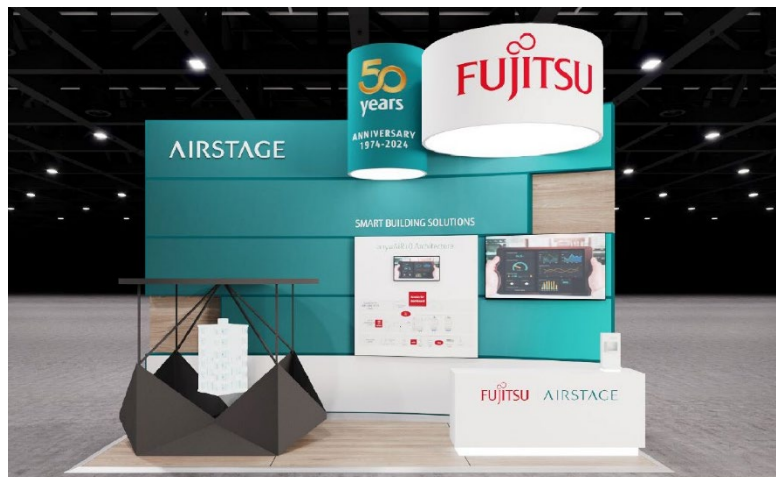
AIRSTAGE booth (image)