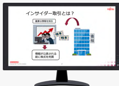
An image of internal education related to insider trading

Based on the FUJITSU GENERAL Way's Code of Conduct principles of "We comply with all laws and regulations" and "We maintain confidentiality," the Fujitsu General Group has established the Regulations for the Prevention of Insider Trading to ensure the prevention of insider trading to fulfill its corporate social responsibility. As an example, employees are required to make prior notification when buying, selling, or otherwise trading the Company's specified securities. In addition, we provide internal training to our employees covering the subject of insider trading to ensure compliance with laws and regulations, and acquaint them with our internal rules regarding the proper handling of insider and confidential information.