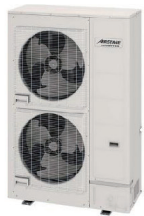
AIRSTAGE J Series

Released 20 models with improved flexibility in installation and facility design, including the industry's smallest J-IVL series.