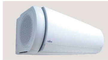
"nocria" X Series

Released the new "nocria" X series, the first-in-industry product to automatically perform "heat exchanger with heating sterilization" functions when the user is not at home, based on AI learning the user's rhythm of daily life.