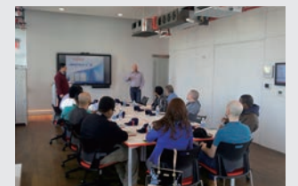
Training at vocational technical schools

Through these activities, we believe that not only will we cultivate future engineers, but that they will learn about our products and become fans of our products, which will lead to stronger support for our products in the future.