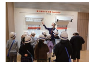
Conducting social studies field trips and factory tours