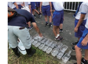
Protecting and nurturing rare species