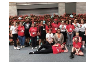
Charity event in New Zealand (FGNZ)