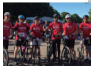
Regular participation in the charity "Bike Event" program for brain tumor patients (FGACUK)