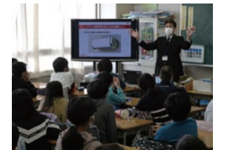
Career education for elementary school children.