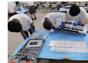
Vocational ('manufacturing') experience for high school students.