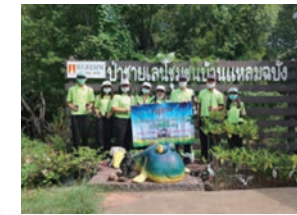
Tree planting and beach cleanup (FG Thailand)