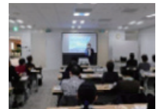
Co-organization of seminars for citizens in Takatsu Ward and provision of venue.