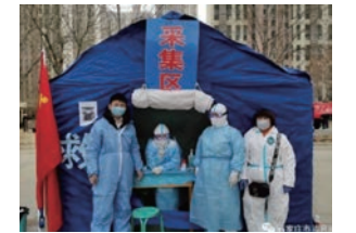
Volunteer participation in PCR testing activities (FGCA)