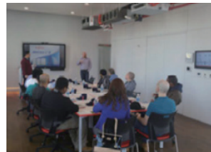
Implementation of regular technical training at technical vocational schools (FGAI)