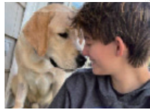
Promoting activities to make dreams of children with serious illness come true (FGAI).