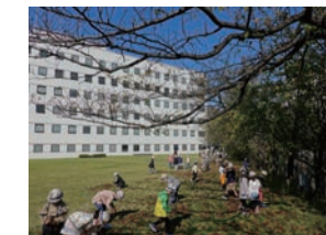
Opening up green spaces to nearby elementary schools